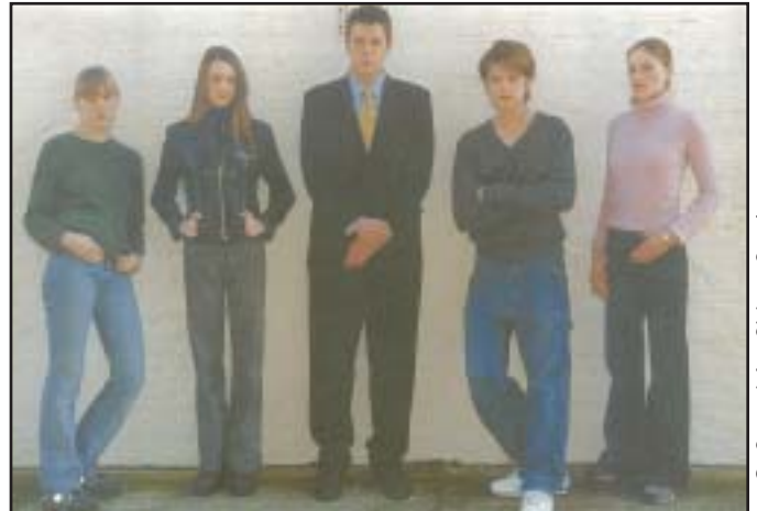
From left to right the ages are: 19, 14, 16, 20, 15.

Take a look at this photograph. Can you guess the age of these young people?